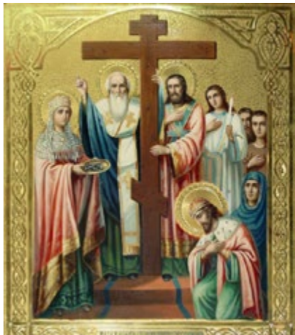
Icon of the Universal Exaltation of the Precious and Life-Giving Cross

The Elevation of the Venerable and Life-Creating Cross of the Lord: The pagan Roman emperors tried to completely eradicate from human memory the holy places where our Lord Jesus Christ suffered and was resurrected for mankind. The Emperor Hadrian (117-138) gave orders to cover over the ground of Golgotha and the Sepulchre of the Lord, and to build a temple of the pagan goddess Venus and a statue of Jupiter.