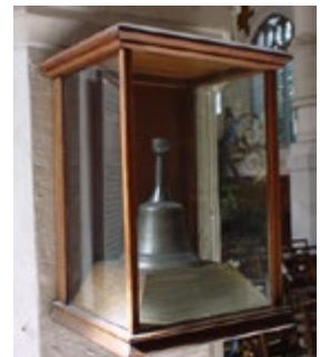
The Execution Bell

St Sepulchre's is the main church for musicians in Britain. The names of great composers are connected with it. The north aisle houses "the musicians' chapel" where the composer John Ireland (1879-1962), the conductor and initiator of the famous "promenade concerts" Henry Wood (1869-1944; buried in the chapel), and the Australian-born singer Nellie Melba (1861-1931) are commemorated in stained glass. There is also the musicians' Book of Remembrance.