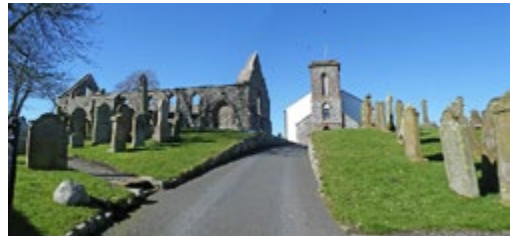
Ruins of the Whithorn Priory on the Whithorn peninsula

Such was the fame of Ninian that his veneration spread to Kent and to Denmark. Today he is even venerated in the USA and the Nova Scotia province of eastern Canada where the Catholic Cathedral in the city of Antigonish is dedicated to our saint.