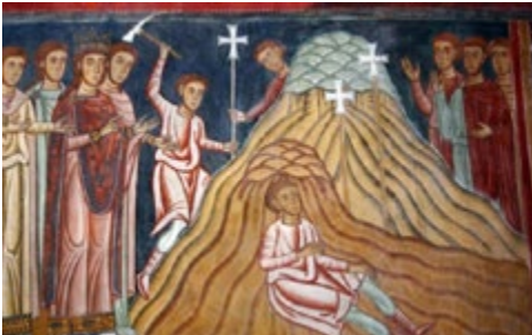
The holy Empress Helen discovering the Life-Giving Cross. Capella San Silvestro (XIII century) in the complex of Santi Quattro Coronati in Rome, Italy

Finally, they directed her to a certain elderly Hebrew by the name of Jude who stated that the Cross was buried where the temple of Venus stood. They demolished the pagan temple and, after praying, they began to excavate the ground. Soon the Tomb of the Lord was uncovered. Not far from it were three crosses, a board with the inscription ordered by Pilate, and four nails which had pierced the Lord's Body (March 6).