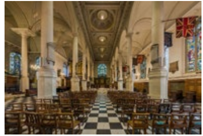
The interior of St Sepulchre

largest parish church of the City. In the fifteenth century it was rebuilt but after the fire of 1666 only the outer walls and a tower (150 feet high) remained. The church was quickly rebuilt by its faithful parishioners and in the 1870s it was restored again. The church miraculously remained practically intact during the Second World War – only a watch-house (used for deterring robbers) was destroyed.