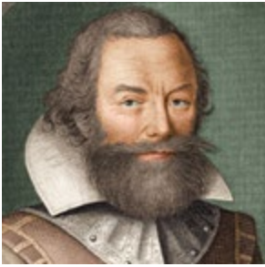
Captain John Smith

The church has close military links: the south aisle has “a regimental chapel of the Royal Fusiliers”, and next to the church there is a memorial garden to the Royal Regiment of Fusiliers. Royal riflemen hold an annual services at the chapel, and at its west end the riflemen who fell in the two World Wars are commemorated in remembrance books.